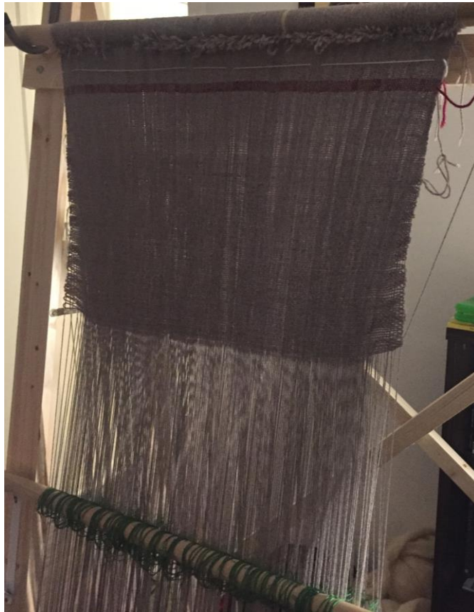
Initial weaving project