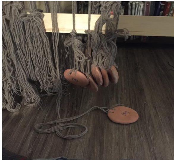
In- process tying of warp onto the warp weights

Experimental Archaeology is the replication and use of premodern artifacts, processes, materials or structures under controlled conditions. It adheres to the scientific method and is used to improve our knowledge of ancient technology. This undergraduate research project looks at the creation and production of textiles in Classical Greece, specifically using a single heddle warp weighted loom and investigates the process of making a classical chlamys, with intent to create a finished woolen textile. As textiles were a daily part of life, as well as an important economic factor within the household GDP and trade in general, the experiment can be used to determine the production value of an average household and provide a more nuanced understanding of textile production in daily life (Foxhall, Canavan). As an experimental archaeology project, this research sheds light on aspects of greek household economics, the contribution of women's unpaid labor in domestic contexts, and the requisite skills to produce this type of essential craft within the ancient Greek world.