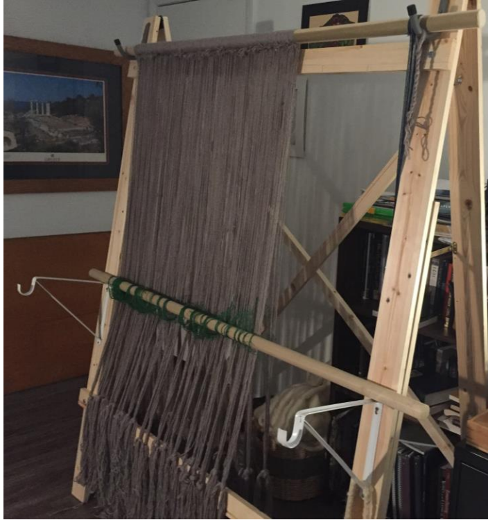
Fully strung warp and loom constructed by author